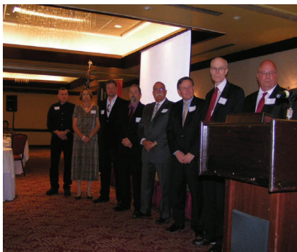
Installation of Officers & Directors